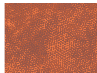
1867-O10* 3 1/4 yds (includes binding)