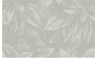
7816-N* 3/4 yd