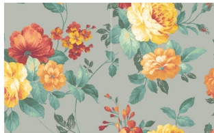
7813-N** 6 3/4 yds (includes backing)