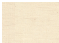
T-Tapioca* 1 1/4 yds