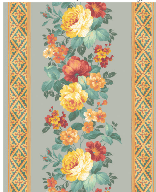
7814-3** 2 2/3 yds

Blend with fabrics from the Textured Solids and Dimples collections by Andover Fabrics