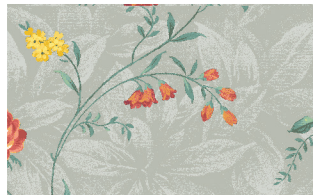
7815-N* 1 1/4 yds